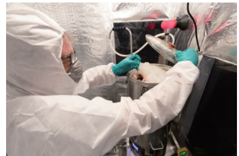
Alkaline extractor for meat components

All food-production devices in the exhibition are equipped with custom-developed sensors. They measure in real time various environmental indicators: heat generated during compost decomposition; concentrations of CO 2 and methane produced by microbial respiration and fermentation; nitrogen-cycle data related to animal husbandry; and more. These are used to monitor decomposition efficiency, ecological balance, and optimal environmental conditions. As data is generated and accumulated day by day during the exhibition, the process becomes a critique of the contemporary condition in which data itself is valued over ecological reality in food production.