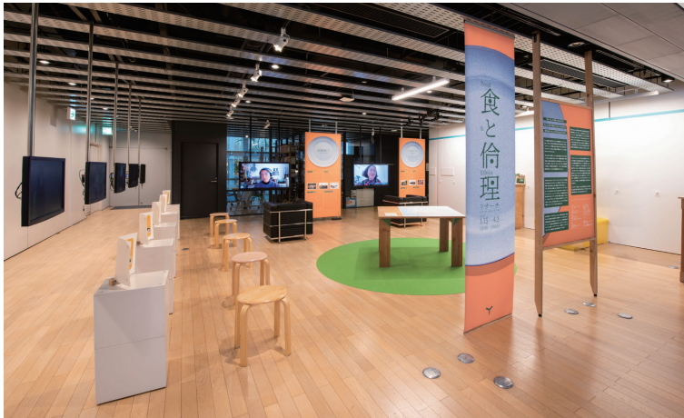
"Food and Ethics Research Showcase" (2021)

Since its opening, YCAM has been exploring new forms of artistic expression utilising media technologies and creating and exhibiting numerous original fine and performing art works. Next to the production of works, we also engage in various research activities such as the "YCAM Bio Research" project, a platform for investigating biotechnology application possibilities as a discipline rapidly developed and universalised in recent years. These activities aim to shape and propose new values revolving around the possible application of technologies for creative purposes.