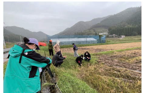
"Food and Ethics Research" in Yamaguchi (2022)

The food policy implemented in Indonesia under the Japanese occupation during the Pacific War has affected the Indonesian food system. This is also the general theme of the video installation set up inside Studio B this time. Based on quotes from articles in the propaganda magazine Djawa Baroe published in Indonesia under the Japanese military administration, the work illustrates food-related stories from daily life during wartime. Also on display are various food policy materials, focusing on the group's research related to “Horaimai (Formosan rice),” a type of rice produced in Taiwan under Japanese rule before the war.