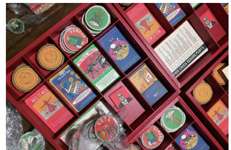
"Hanger Tales"