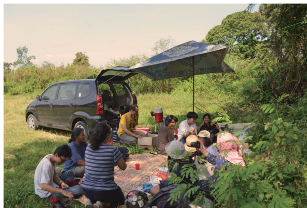
Bakudapan Food Study Group, "Please Eat Wildly"

We hope you will take this opportunity to join us.