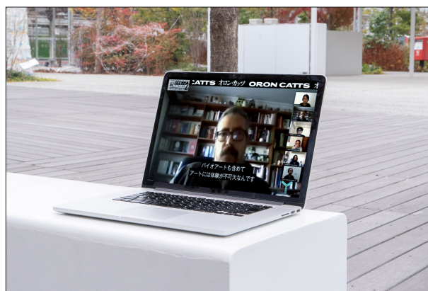
From “YCAM OpenLab 2020: Understanding Living Culture 2”

The Yamaguchi Center for Arts and Media [YCAM] announces the opening of “YCAM OpenLab 2021: Alternative Education” as an online event that reevaluates the roles of art, research & development, and public cultural facilities today. In recent years, artistic activities such as exhibitions and performances of works, have been moving away from the institutionalized environments of art museums or theaters, in a new trend of placing importance on the relationships between creators, spectators and local communities. As a result, the role of venues for such displays of creative work has been changing significantly. Titled “Alternative Education,” this event features a number of special guests who discuss “possible forms of learning through art” and “the role of art centers in society” from their own experience related to art and education. It takes place in the form of talk sessions that are streamed live via the Internet in November 2021 and February 2022, and video footage of other discussions that can be viewed during that period on a dedicated website. Look forward to a set of conversations about art and education with illustrious guests, that will certainly inspire a new discourse, and paint an entirely new picture of the art center in the present age.