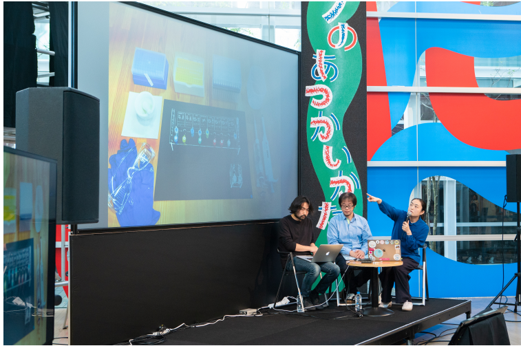
From "YCAM OpenLab 2020: Understanding Living Culture 2"