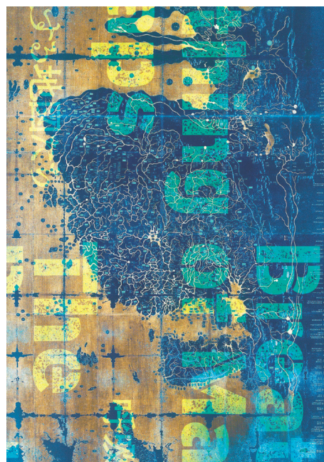
Main visual of "The Breathing of Maps" Design : Shunsuke Onaka (Calamari Inc.)

Treating the geo-bodies of nation-states as dynamic and unstable entities, "The Breathing of Maps" examines social transformations that lie between maps - between different areas, eras and errors. Unfolding over 12 weeks, the exhibition brings together a network of artistic and research practices that chart the shifting intersections of capital, crisis, citizenry and the colonial in their respective locations. The exhibition includes artworks, performances, lectures and workshops which complicate conventional ideas of cartography, propose counter-mapping potentialities, and foreground imaginative mappings and continuities between people, place, and practices.