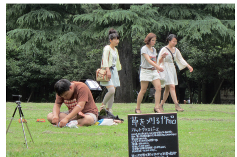
chi too "Cut Grass Piece"