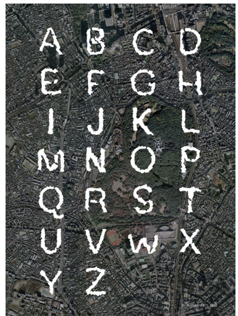
yang02 "Urbanized Typeface"

In addition, document works related to lecture performances / lectures by participating artists and researchers will be presented.