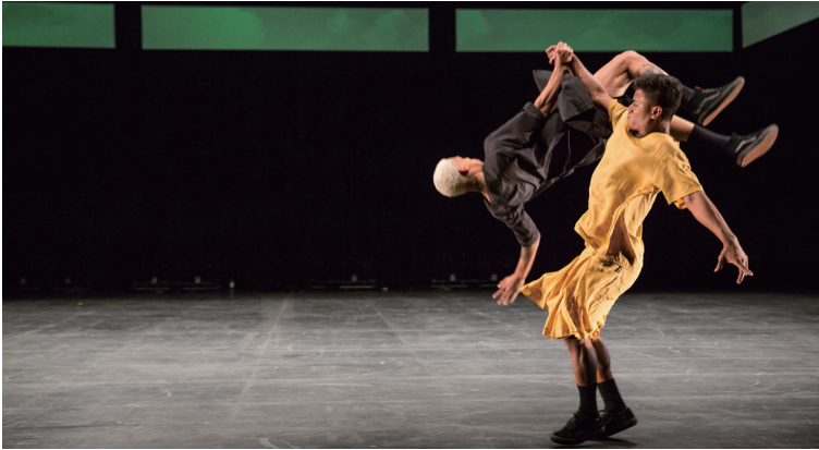
Grupo de Rua "Inoah" (2017)

Grupo de Rua's latest work "Inoah" that will be performed this time is a dance piece that illustrates the daily routine of cities around the world today.