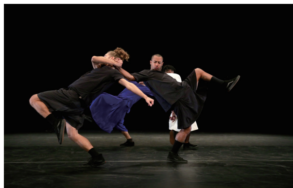
Grupo de Rua "Inoah" (2017)

INQUIRIES: Yamaguchi Center for Arts and Media [YCAM] PR representative TEL: +81-(0)83-901-2222 FAX: +81-(0)83-901-2216 email: press@ycam.jp 7-7 Nakazono-cho Yamaguchi-shi Yamaguchi 753-0075 JAPAN http://www.ycam.jp