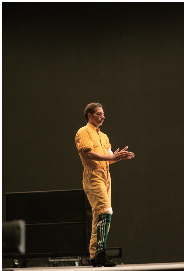
Israel Galván

In "Israel & I s r a e l イスラエル" the creative studio Qosmo, which specializes in algorithm-based art, will take the complex, fast-paced zapateado technique of beating time with the feet of which Galván is a master, and teach it to AI (artificial intelligence), using this learning to express "Galvanesque qualities" via robotics. Having another "Israel Galván" with Galván's characteristics performing with the real Galván will illuminate Galván's genius in unprecedented fashion. Don't miss this fantastic opportunity not only to experience the allure of flamenco with its ongoing overlaying of innovation on tradition, but glimpse a new kind of creative relationship emerging between ourselves and technology, at a time when so many different technologies exist in our lives.