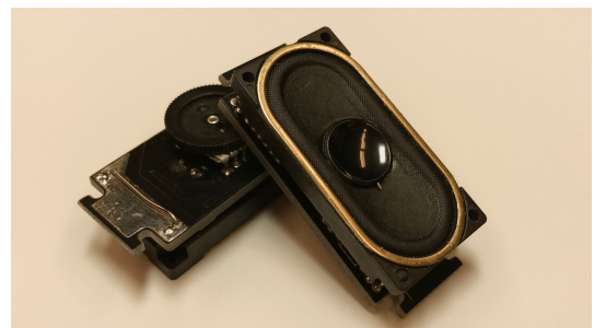
"The SINE WAVE ORCHESTRA stay" Visitors can wear this device at the exhibition venue.