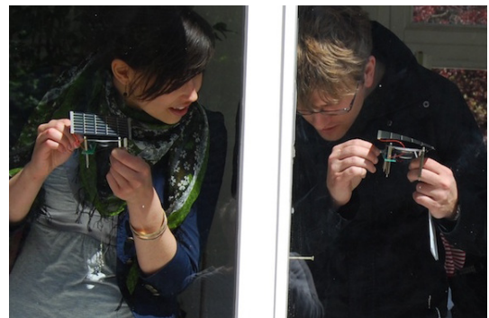
"in the sun", first exhibited in 2010 (reference images)

This work is exhibited in a space that leads down to the basement of the YCAM building. Variations of sine waves of certain frequencies derived from the location's spatial characteristics are audible from multiple speakers. These sounds change dynamically depending on the listening position, which means that every visitor experiences the work individually in a different way.