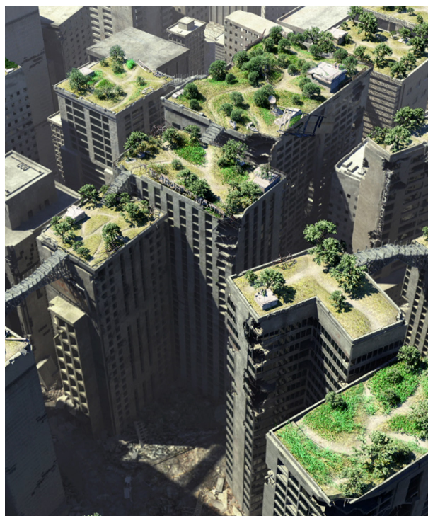
MOON Kyungwon "Promise Park" (2013 / YCAM)

In addition to this exhibition, it will also include a large-scale exhibition in 2015, for which the research results presented here are planned to be updated in parallel with a new installation piece.