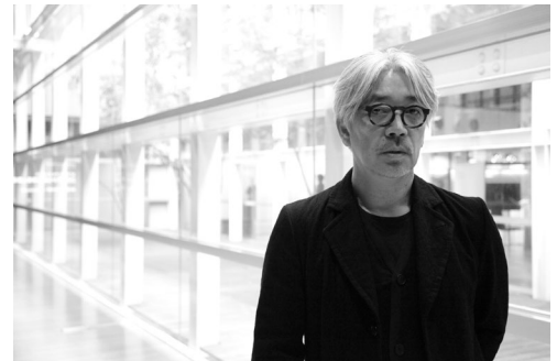
YCAM 10th Anniversary Artistic Director Ryuichi Sakamoto

*Japanese-English simultaneous interpretation available