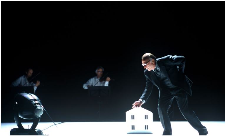
Heiner Goebbels "ERARITJARITJAKA" (2004)