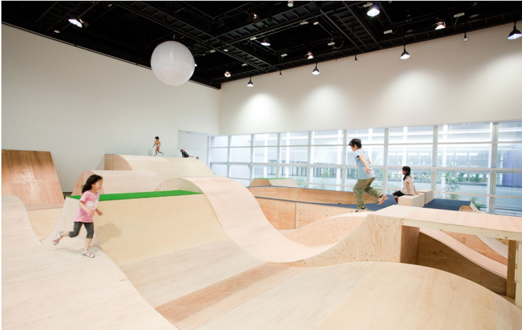
"Korogaru Koen Park" (2012/YCAM)

The prototype behind the "Korogaru Pavilion" that is being announced at this time is the "Korogaru Koen Park," a park-type installation that was announced at the "glitchGROUND—A media art center's proposal for new educational environments" exhibition in May 2012. Korogaru Koen Park, which was produced as new type of place for learning and playing where children can autonomously come up with ideas for play and gain knowledge, was visited by more than 37,000 people over an approximately 3-month period, reaching great success.