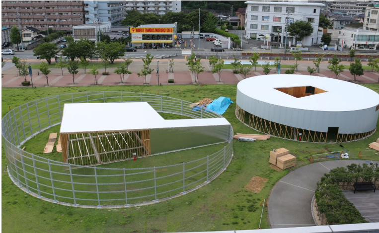
"Korogaru Pavilion" under construction in Yamaguchi City's central park

"Korogaru Pavilion" that is being announced at this time is an expanded and upgraded version of "Korogaru Koen Park."