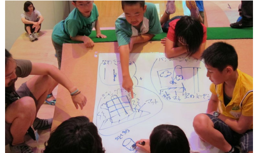
"Kids' meeting for better playground" held last year

Be sure to take notice of changes to the Pavilion enabled by users' ideas.