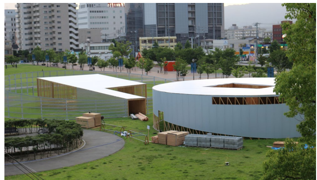
(Top) Sketch by the architect unit "assistant" (Bottom) View of the site currently under construction