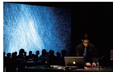
[Top] Ryoichi Kurokawa ©Ryoichi Kurokawa evala (sound tectonics #7, 2007, YCAM)