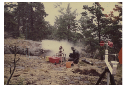
"Island Eye Island Ear" Project by Experiments in Art & Technology (Knävelskar Island, Sweden, 1974)