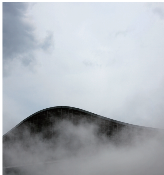
"CLOUD FOREST" [Central Park] (YCAM, 2010)

Visitors can experience transformations in their perception as they interact with artworks incorporating information technology while walking in the fog in the patios or surrounding park. While introducing and reevaluating foresighted art and science projects originally presented at the EXPO '70 Osaka, which eventually inspired this new project, the exhibition anticipates the future of environmental creation, "informational spheres" of tomorrow, and possible creative quests through art.