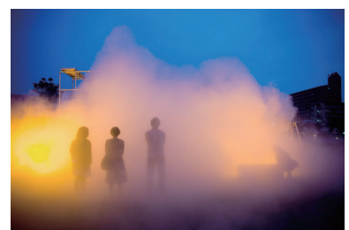
“CLOUD FOREST” [Central Park] (YCAM, 2010)

Fujiko Nakaya's “fog sculptures” are exhibited in wide outdoor spaces. Like in the patios, clouds of artificial fog will be generated also in the central park in front of YCAM. Due to rapidly changing wind conditions, here the fog clusters will move in instantaneously shifting patterns. While marveling at these massive formations of fog quite different from the sceneries in the patios, the visitor can witness how these “fog sculptures” flow and merge with the environment.