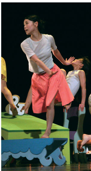
"not quite right"

Following a year of exchange and experimentation between Strange Kinoko Dance Company and plaplax, a group of media artists who have been working extensively in the realm of interactive art, a new dance piece is being created in a month-long artist residency at YCAM. Although both groups work in different genres, they both share a cute kind of pop sensibility. This novel combination promises to uncover new possibilities between media technology and performing arts, visualized in an experimental yet somewhat stylish dance piece revolving around interaction of body movement and imagery.