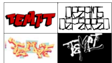
[Top] Tempt1 writing with The EyeWriter